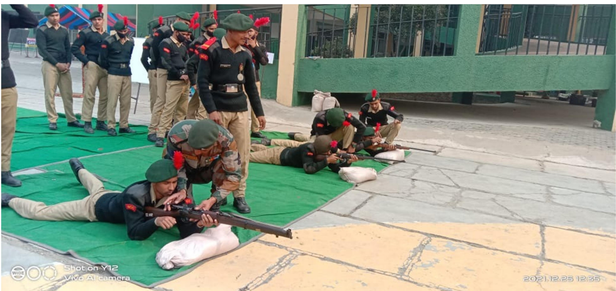
Weapon training in Combined Annual Training Camp