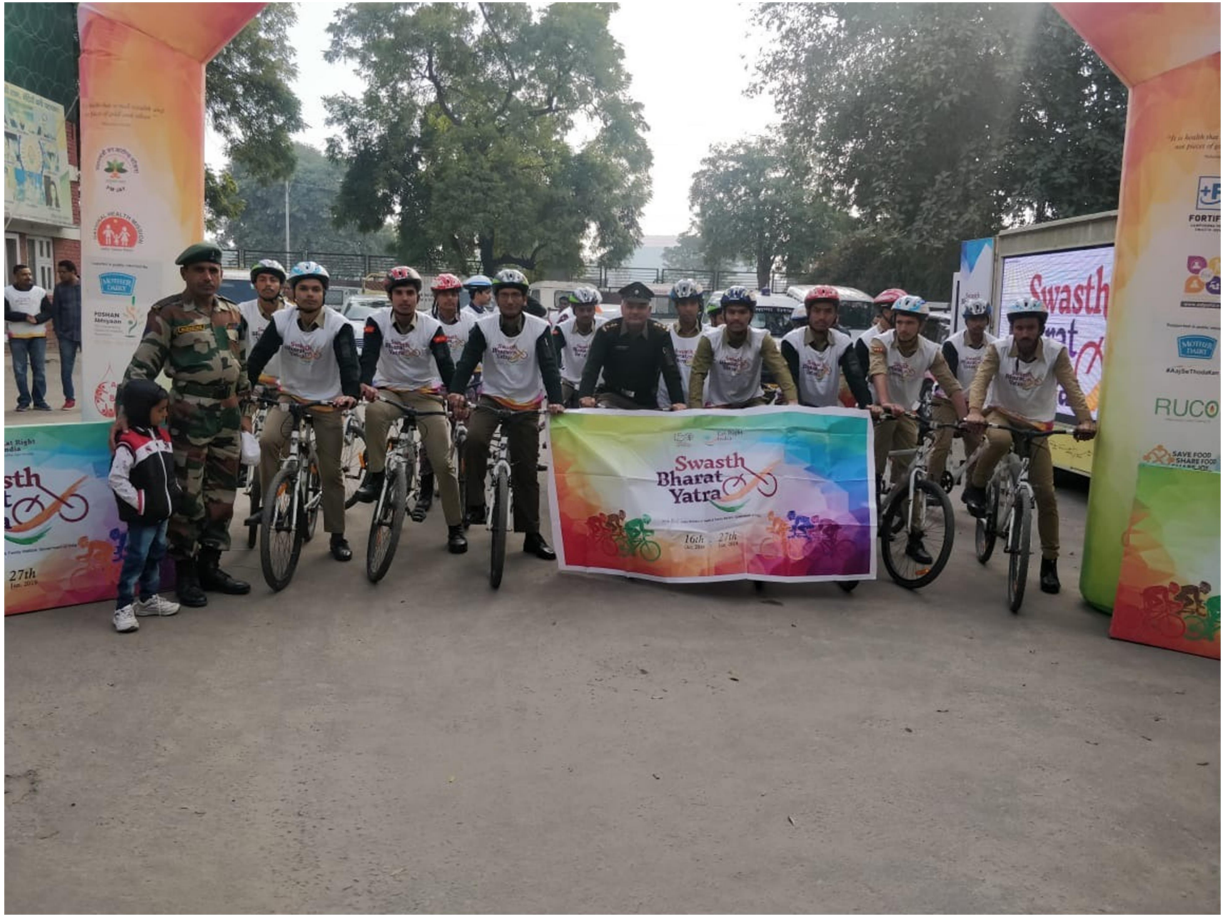
Cycle Rally for Swasth Bharat Yatra