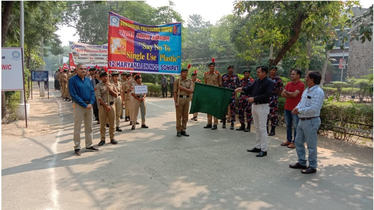
Awareness Rally about no use of single use plastics.